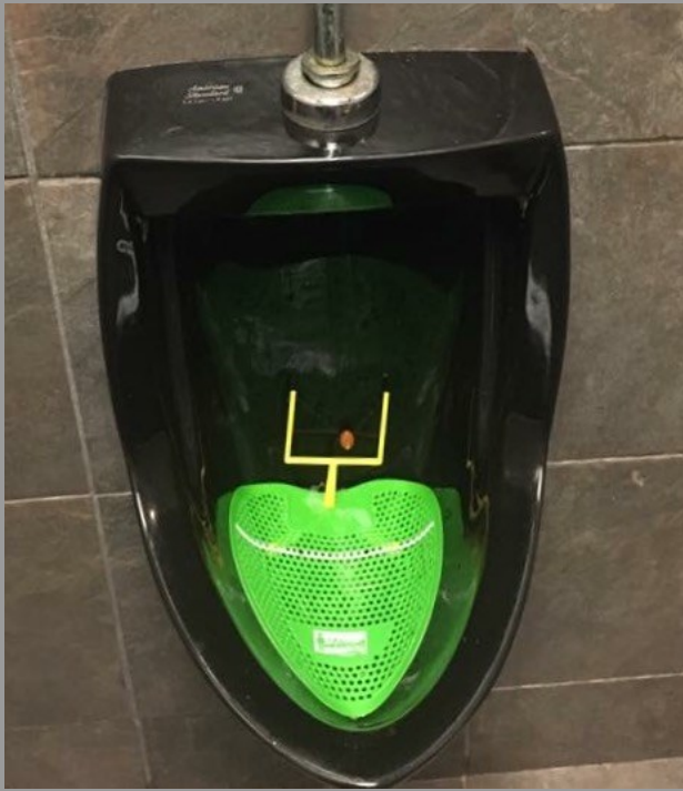
The latest in urinal screens spotted in the Men's Room of a local sports bar. Hit the football suspended between the uprights for three points. Almost as much fun as aiming at a photo of Roger Goodell...Lol